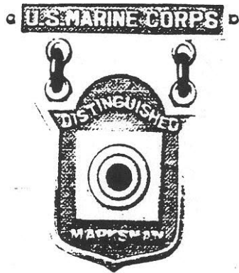
USMC Distinguished Marksman's Badge 1920s - Present

Until well into the 1970s some 90 + years after the adoption of the first Distinguished Badge, the Distinguished Badges were made of 14 k gold, weighing in at almost a full ounce. Since the price of gold was set at $20 until the 1930s it should be no surprise that the cost of replacing a lost badge was $20 coming out of a soldier's pay should he misplace or lose it – a sizeable sum of money for a private who only drew $21 .00 per month. President Richard Nixon, by allowing the price of gold to "float" on the international market starting in the early 1970s drove the price of gold steadily upward sometime exceeding $400 per ounce. Even with gold currently hovering around $300 per ounce, it should be no surprise that by the time the stock of the 14k gold badges was exhausted in the late 1970s the "golden day" of the