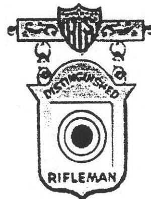
DCM/CMP Distinguished Badge 1959 - Present

The designation “Distinguished Marksman” originally inscribed on the badge continued until 1960, when the U.S. Army and the DCM (now the CMP) decided to change the terminology to “ Distinguished Rifleman. ” To those wearing the Distinguished Badge in the 1950s the term “Distinguished Marksman” seemed a bit archaic. In the 1880s, the term “Marksman” conjured up visions of a man or woman especially skilled with a rifle. By the late 1950s the term “Marksman” usually indicated the lowest rung on the weapons qualification